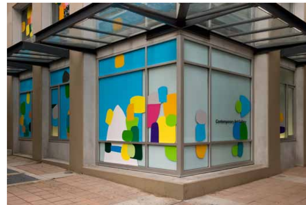
Federico Herrero Vibrantes (2011) Contemporary Art Gallery

The programme will be accessible through most smartphones and can be activated when in proximity to the gallery. Smartphone devices will be available for use at reception. Please check our website for updates.